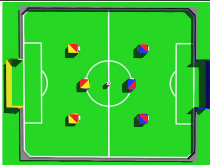
Figure 3 The ball and the 6 robots on the 7 neutral spots as defined in Rule 4.1, Neutral Spots